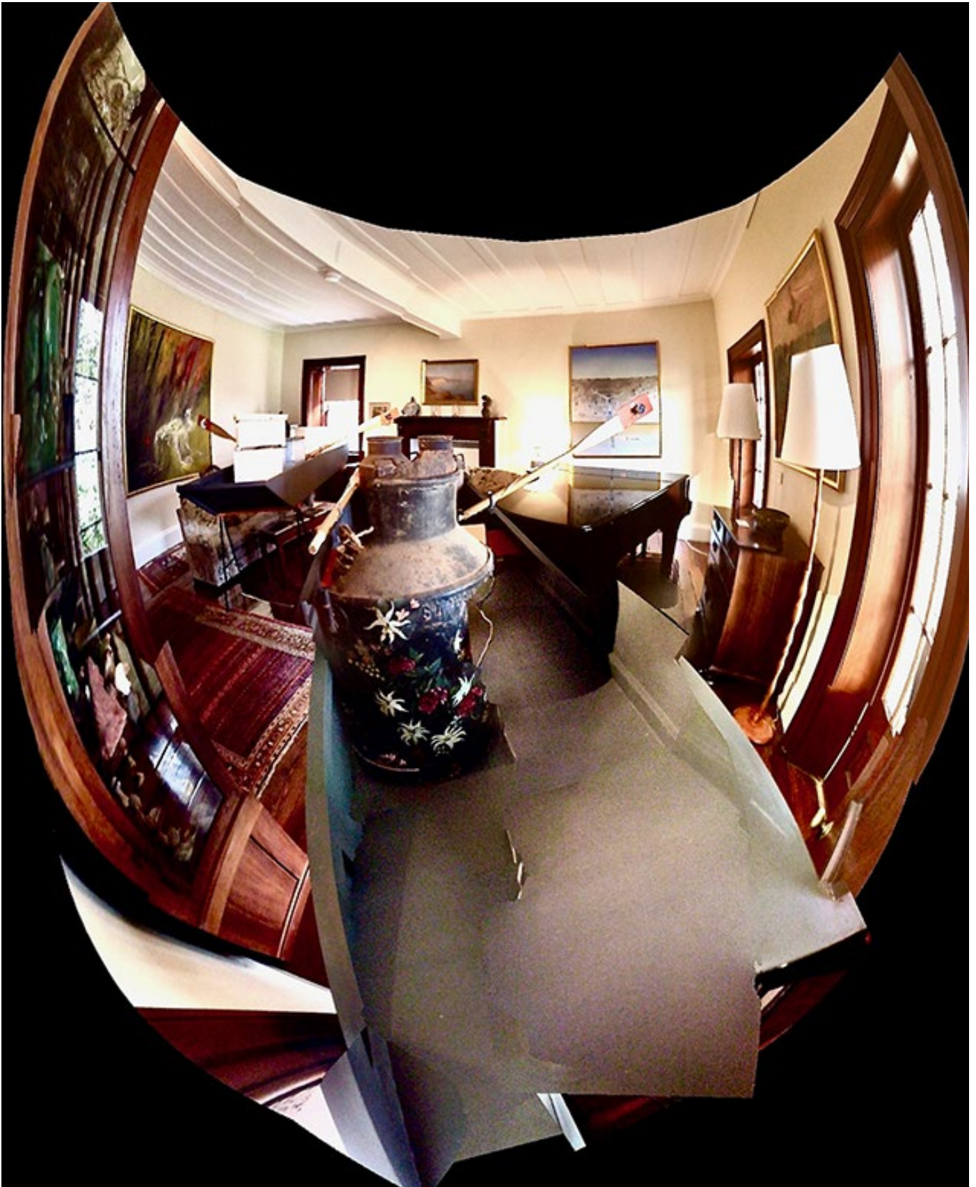
Nigel Helyer, Milk and Honey (2013). Bundanon homestead.

this long-forgotten site with contemporary audio technology: the re-constructed site detects visitors and plays audio sequences from its archive, as if quietly announcing its memories to visitors. Other recent works— Ecolocated (2011) and VoxAura, The River Sings (2011)—create a “sonic cartography” in evoking specific places, with an environmental emphasis. The audio of Ecolocated blended