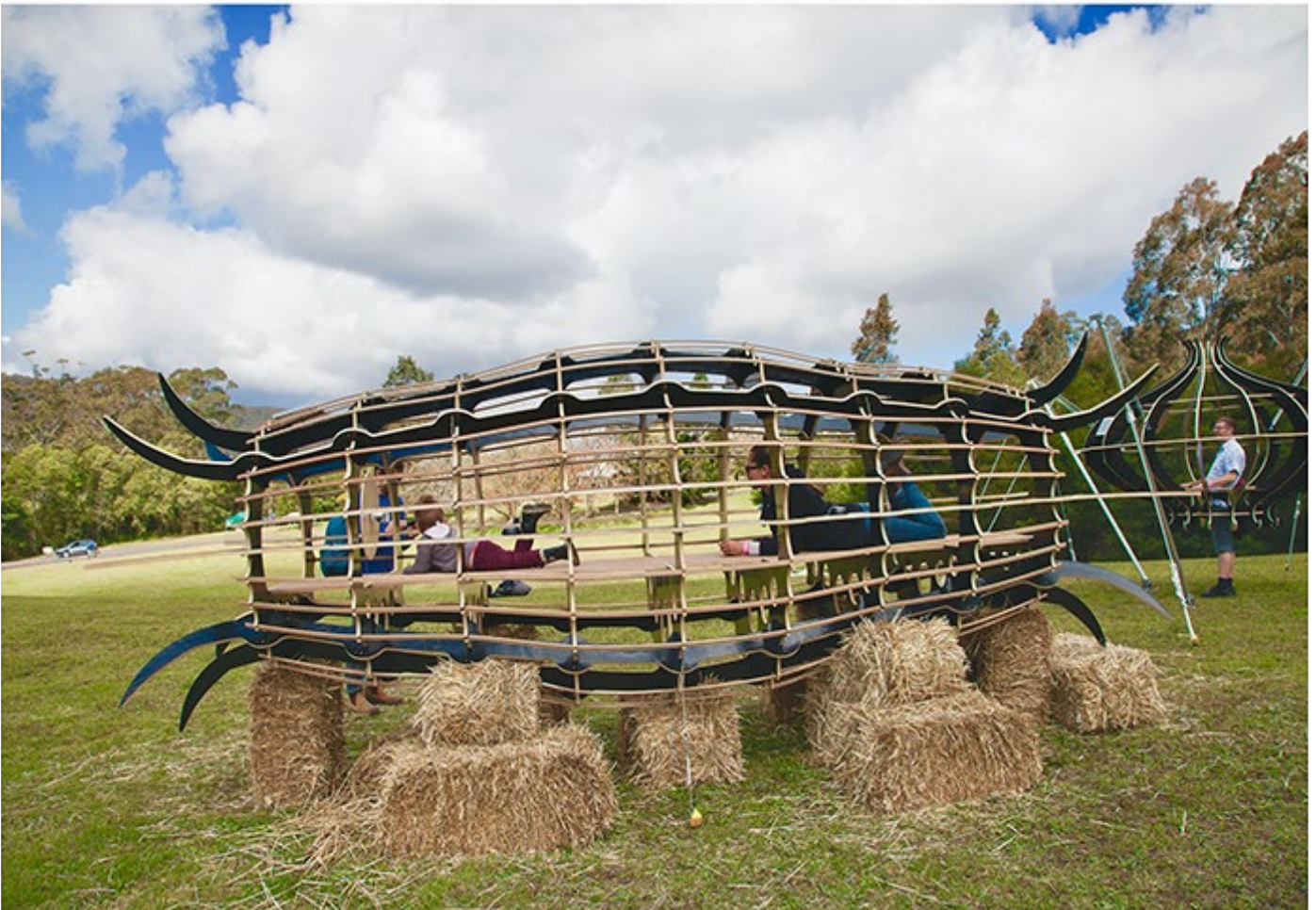
Nigel Helyer, BioPod_V02 (2015). Bundanon.

recordings she made of this acoustic environment included: kangaroos which “thump loudly as they come to and from the lake to drink; frogs are abundantly loud and varied; egrets and kookaburras swoop close by, wings touching the water; the smallest of insects are out and about. It is not peaceful; it is a rowdy, hectic cacophony and one not heard during the day, but only at night in places where people don’t often go.” The experience in the biopod slowly revealed “a complex world that cannot be seen, only heard.” It was the sound of Bundanon, at night, on the lake. The result was “a disarmingly humbling experience in which the human is completely disregarded and not required. For a moment, it is as if the Anthropocene had not begun.” 22